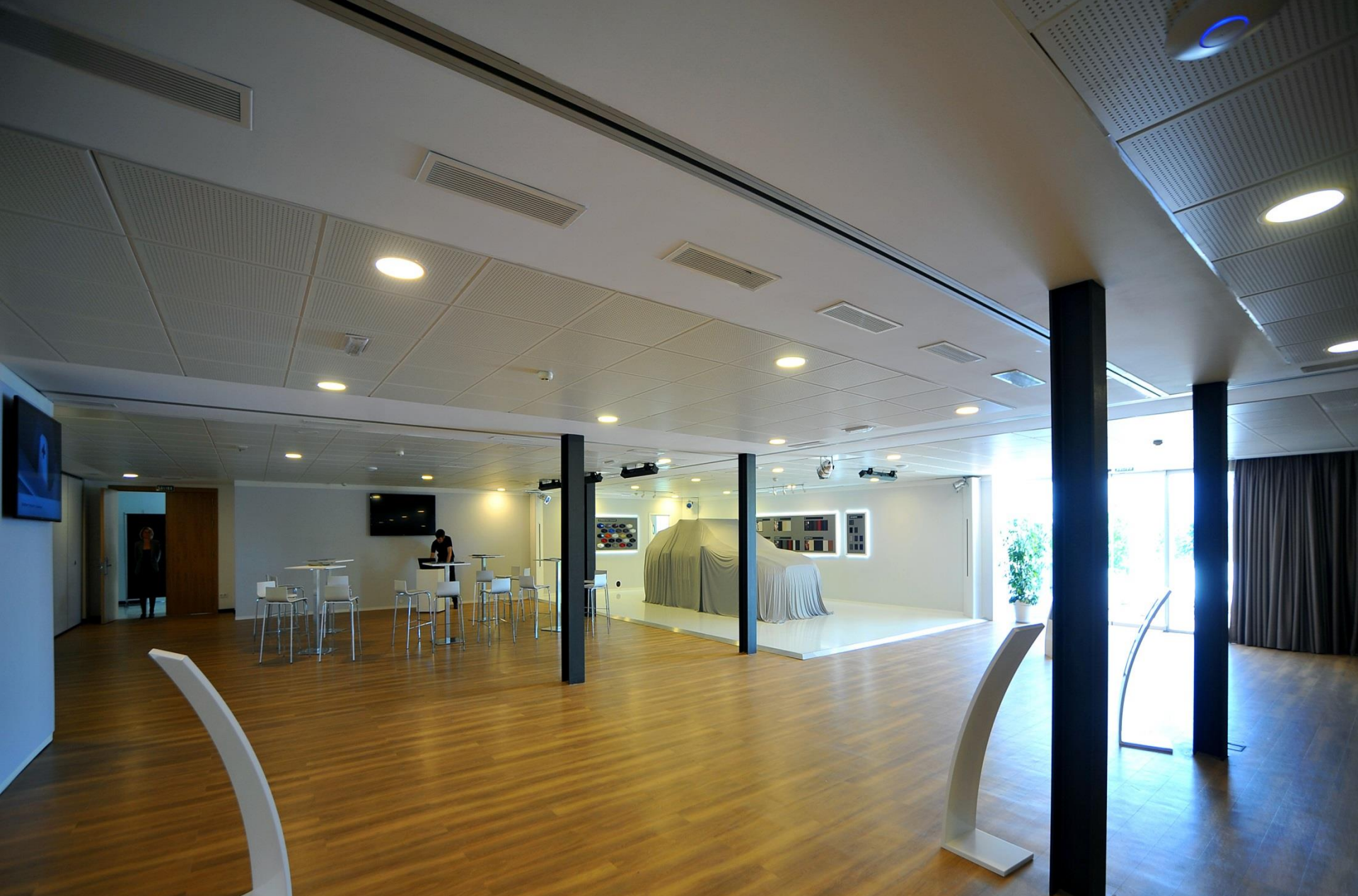
Triana Meeting Rooms (280 m 2 ). It can be split into four rooms. They are facing to the Hotel Gardens