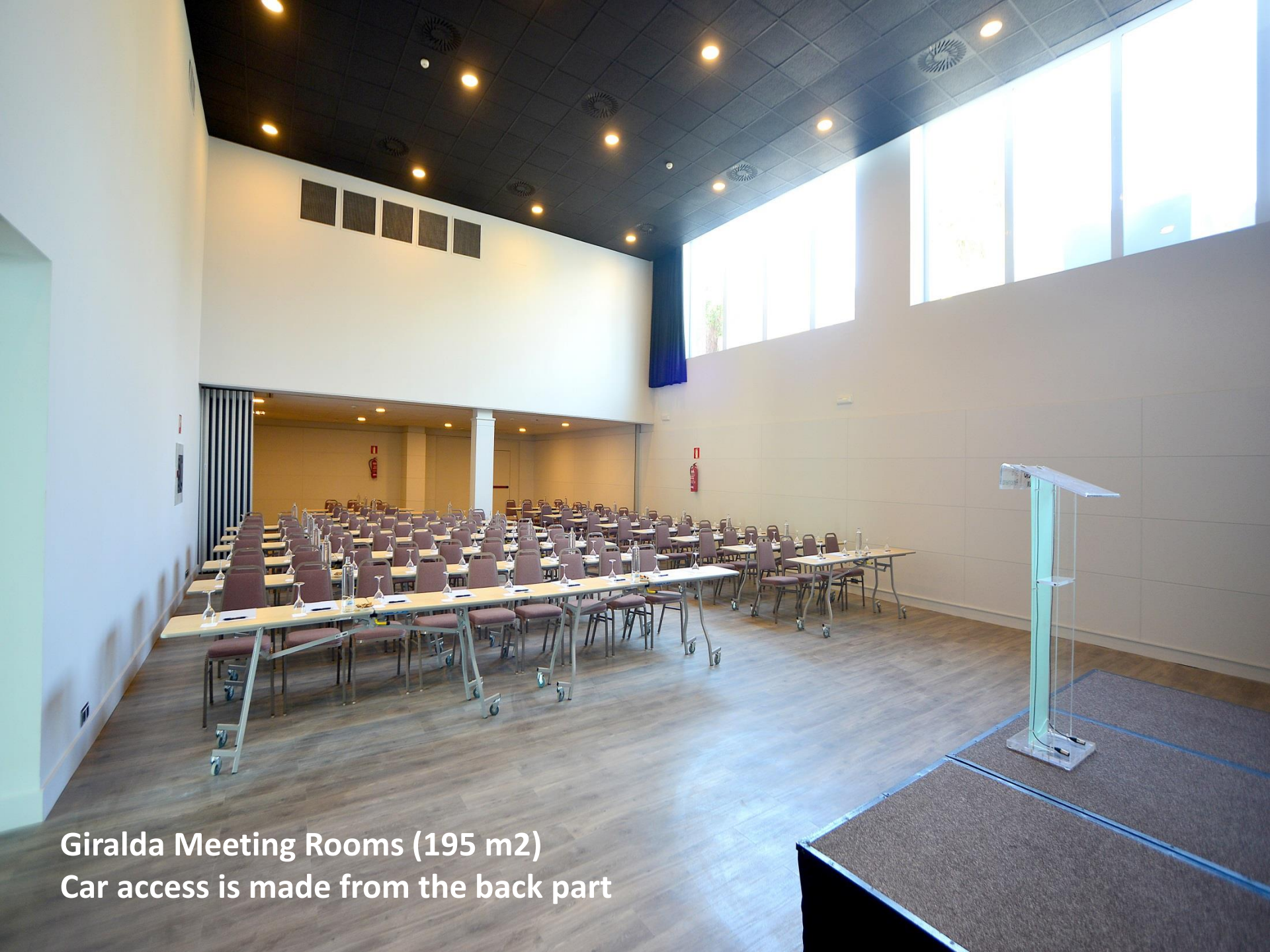
Giralda Meeting Rooms (195 m2) Car access is made from the back part