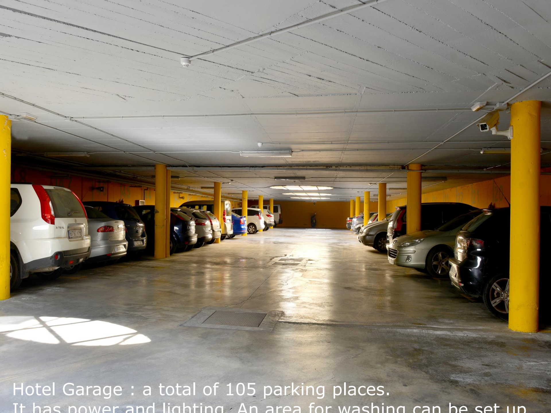
Hotel Garage : a total of 105 parking places. It has power and lighting. An area for washing can be set up